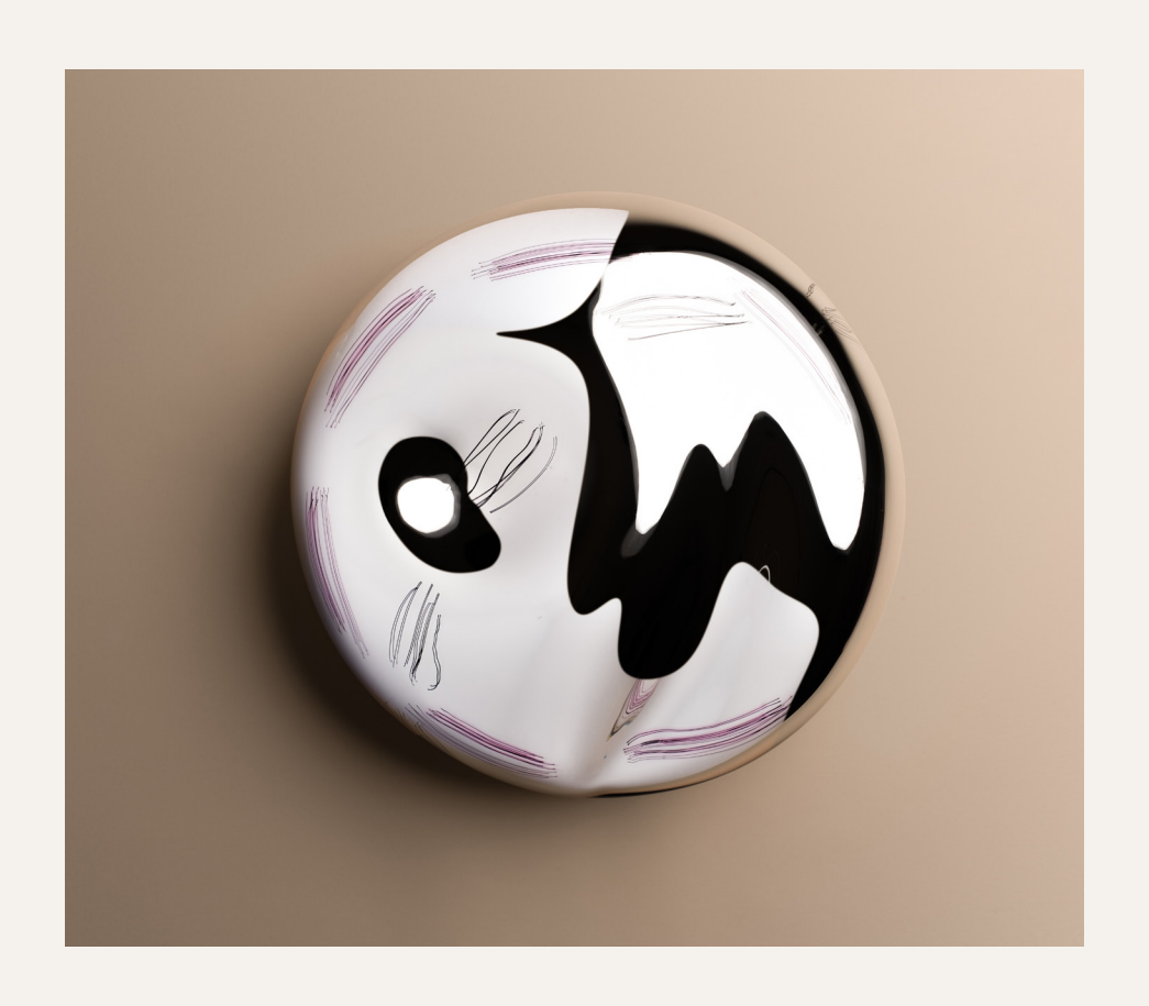
MARCEL HOOGSTAD HAY Pink Aura, 2024 blown & mirrored glass 420 x 370 x 190