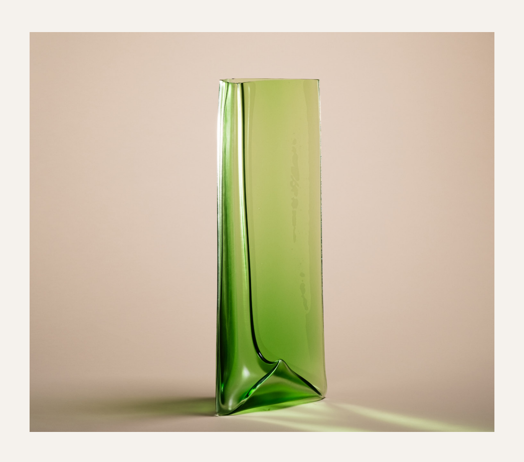
LIAM FLEMING Resting in Colour (Green), 2023