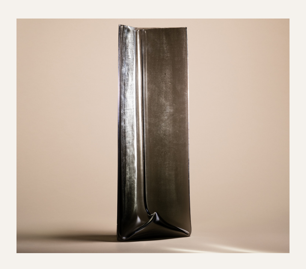
LIAM FLEMING Resting in Colour (Grey), 2023 glass 675 \times 280 \times 180