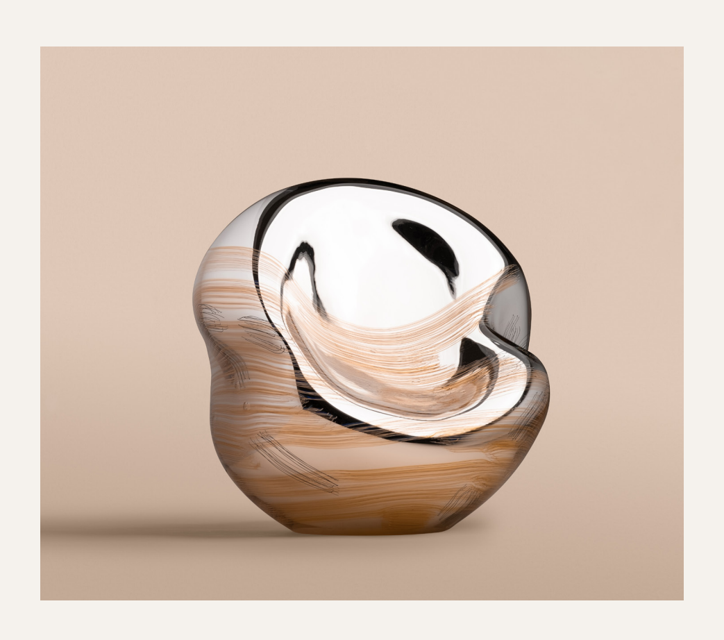
MARCEL HOOGSTAD HAY Trace/Traverse, 2023 blown & mirrored glass 320 x 340 x 310