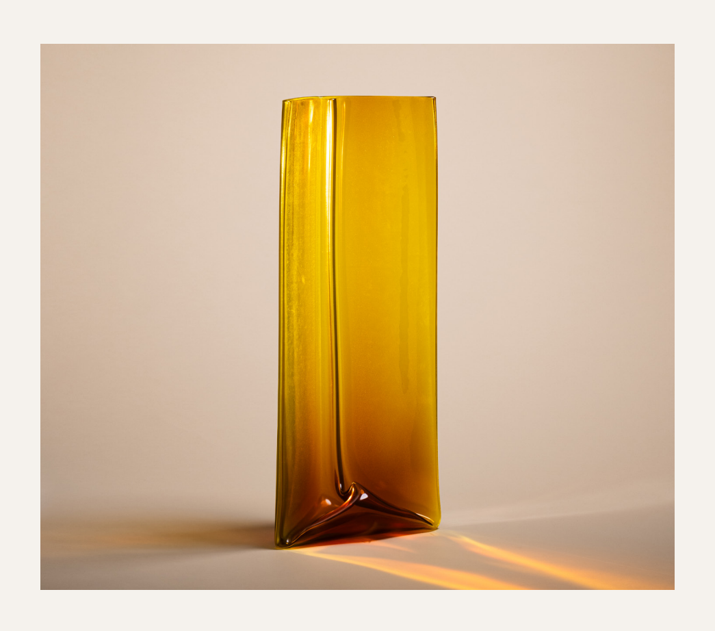
LIAM FLEMING Resting in Colour (Yellow), 2023