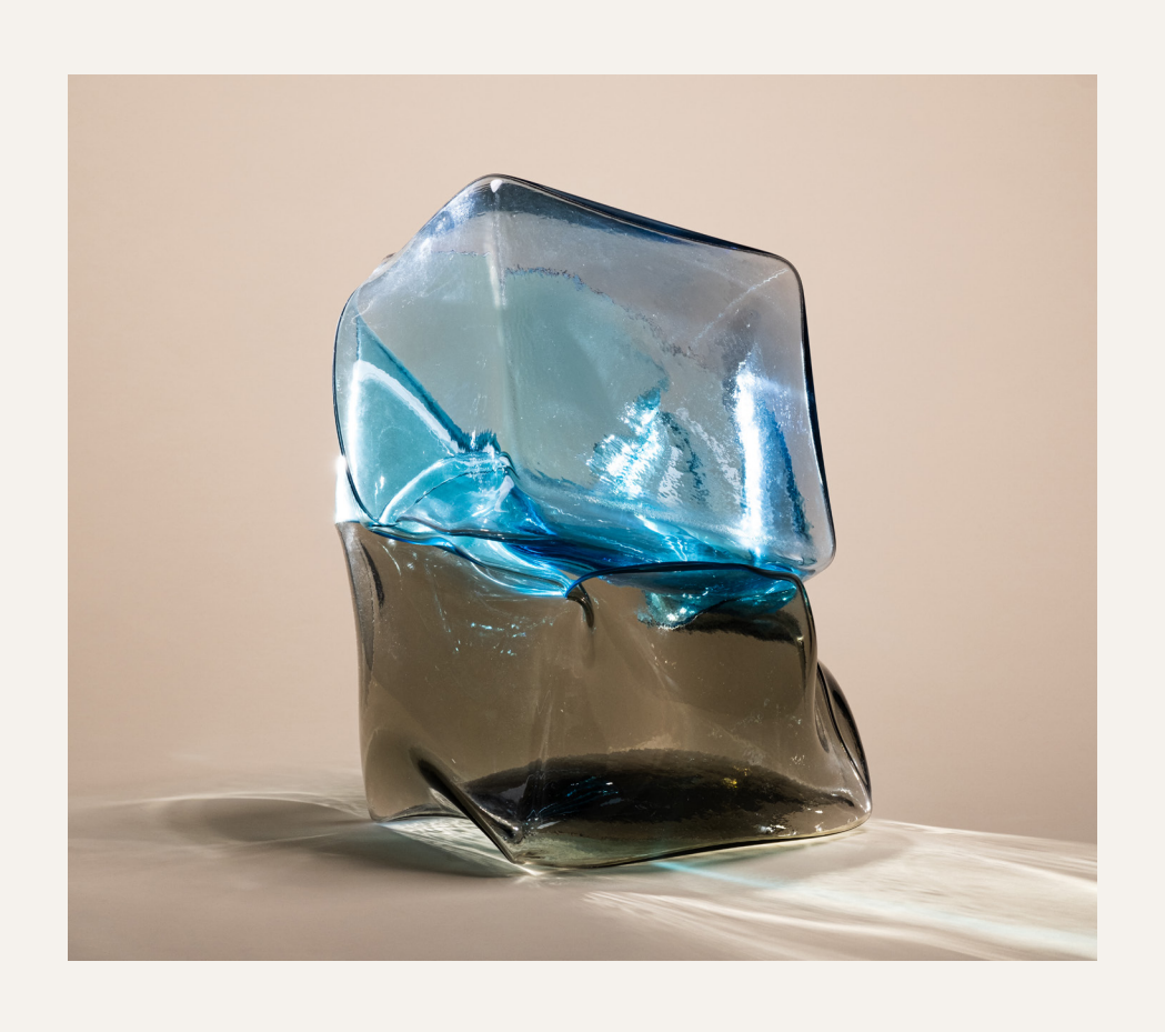
LIAM FLEMING Transitory Form #10 (Blue/Smoke), 2024 glass 420 \times 340 \times 260