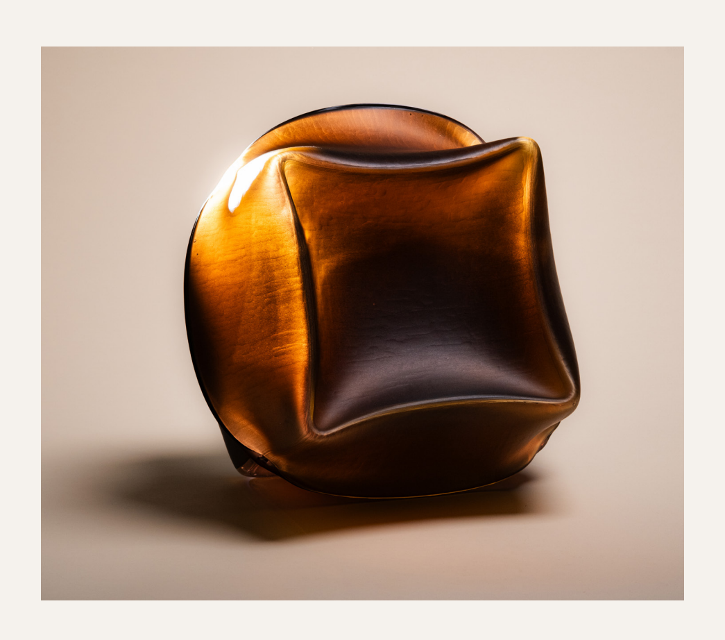
LIAM FLEMING Transitory Form #11 (Brown), 2023 glass 520 × 280 × 180