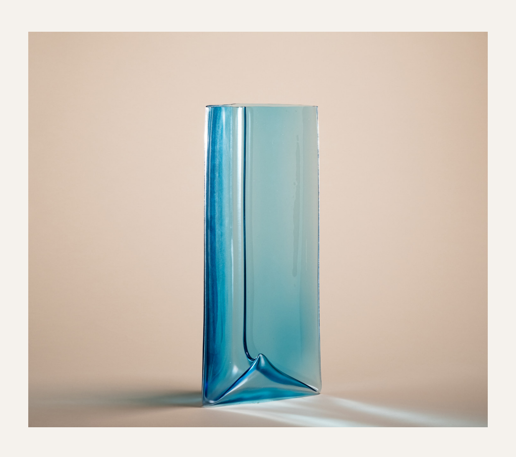
LIAM FLEMING Resting in Colour (Cyan), 2023