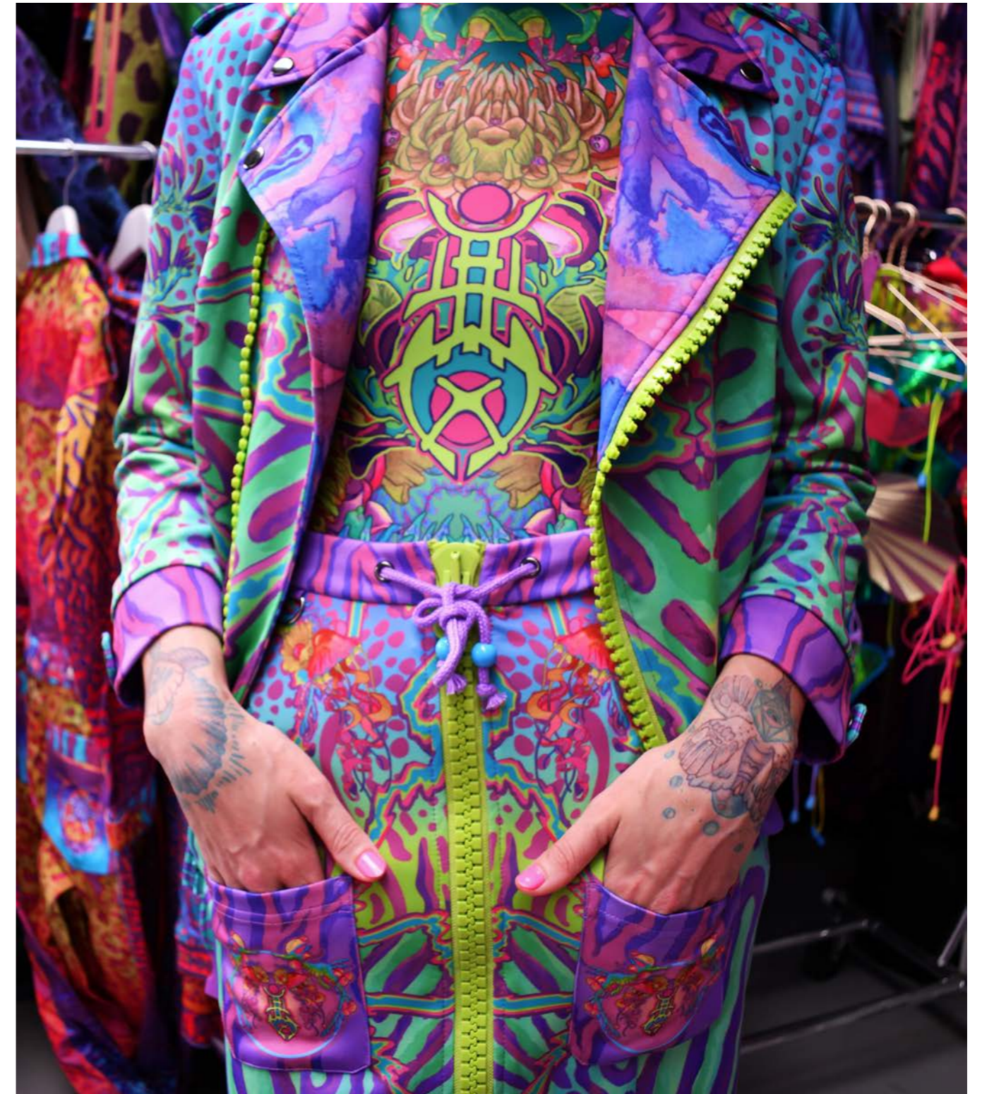
Nixi Killick, Cryptic Frequency Augmented Reality Activated Biker Jacket and Biker Skirt, 2019, scuba knit; Cryptic Frequency Augmented Reality Activated Leotard, 2022, polyester spandex. Courtesy of Nixi Killick. Photo Emily-Rose Hyde-Page.