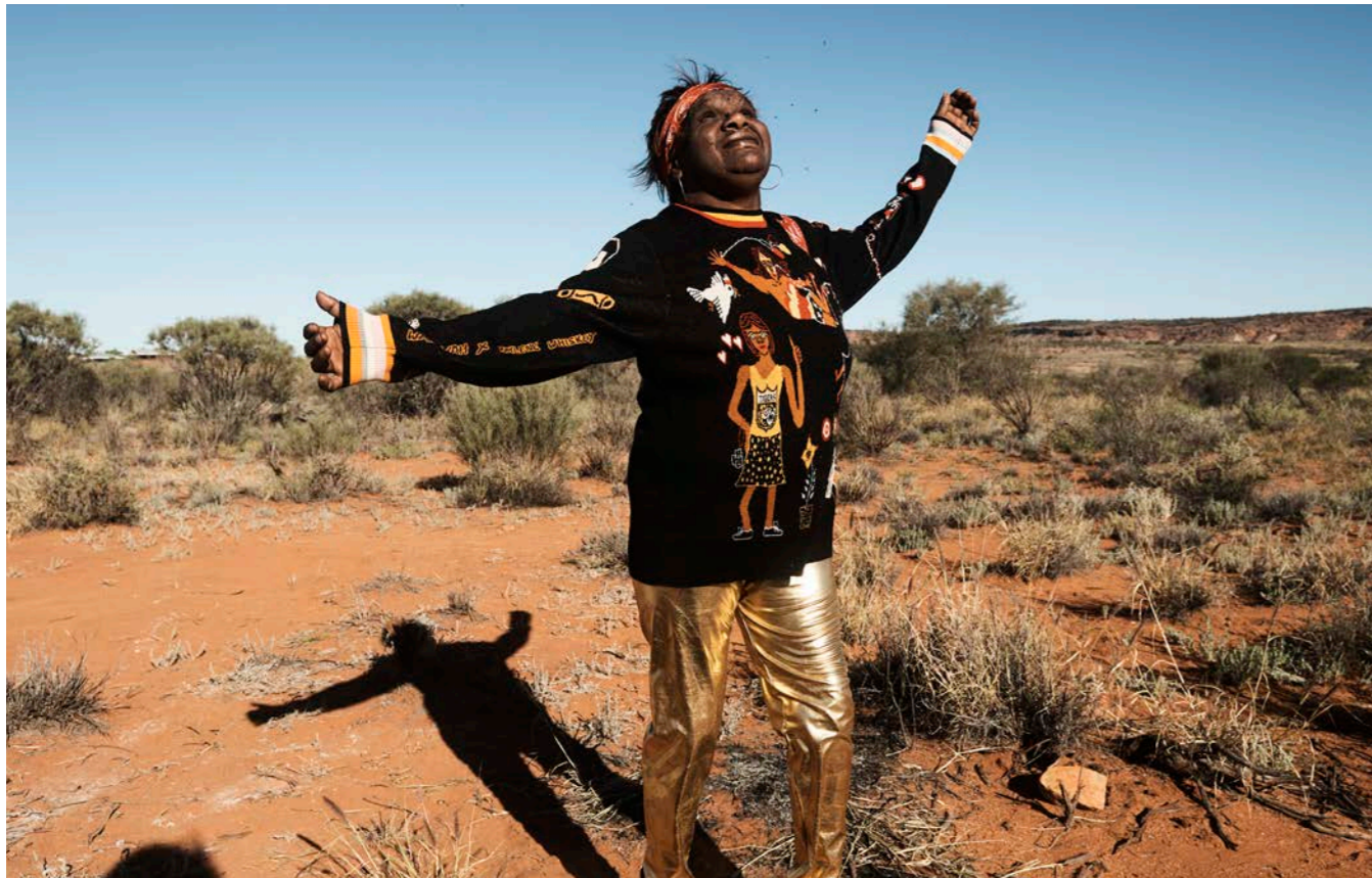
Above: WAH-WAH x KAYLENE WHISKEY, 2021, Australian merino wool. Reproduced courtesy of Kaylene Whiskey and Iwantja Arts. Photo Simon Eeles.

(c. 1970s) fabric where Tiwi Designs artist Angelo Munkara depicts the various fish found around the Tiwi Islands that provide an important source of food for his people. It is also important to remember, especially when discussing diversity, that First Nations people are not a monoculture but comprise a large number of different peoples with different languages, histories and stories – within the group of artists working from Bábbarra Women’s Centre alone there are artists from more than twelve different language groups. xvi