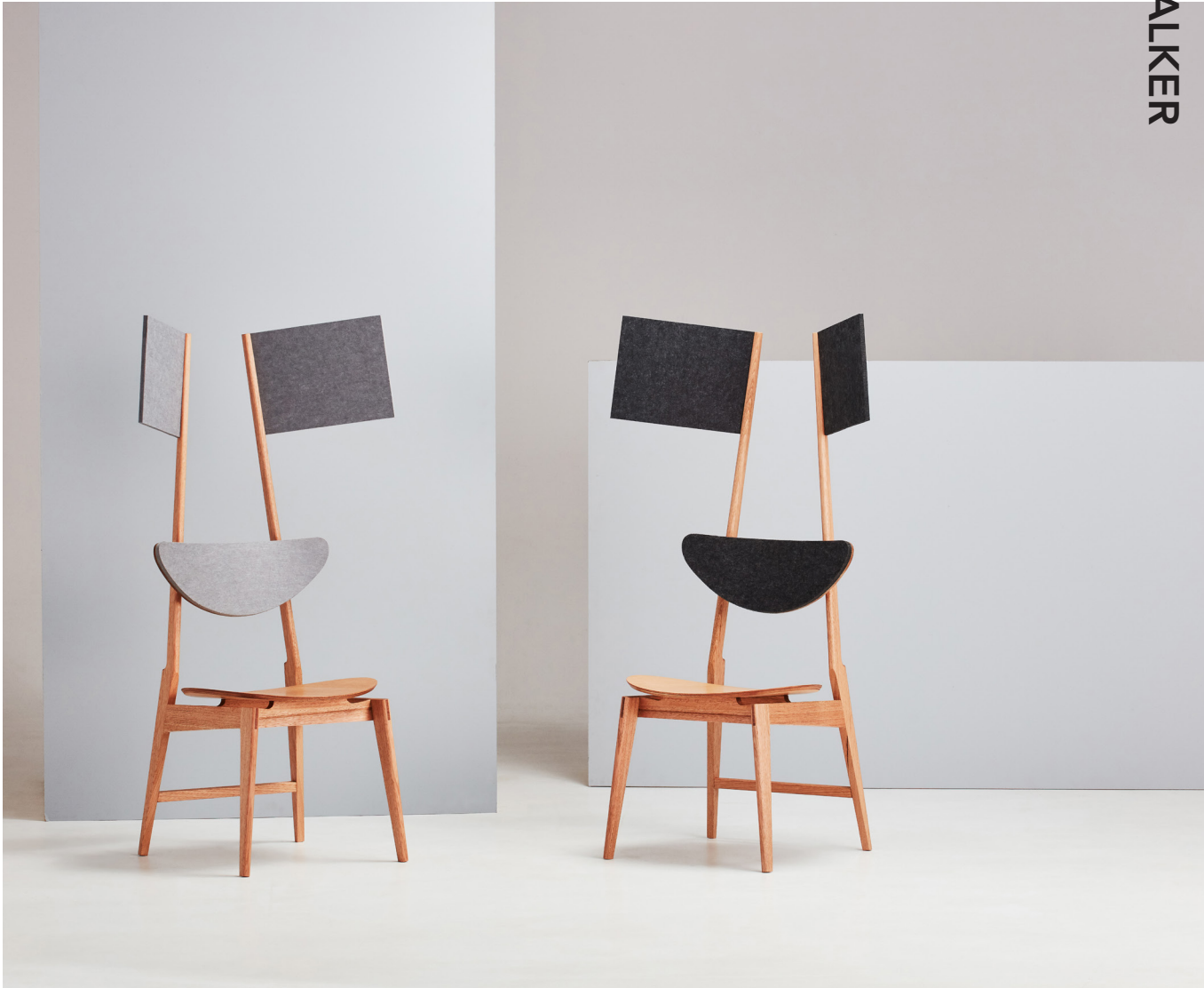
Echo Chair , 2018 Eucalyptus and Ecopanel 1350 x 680 x 550 each